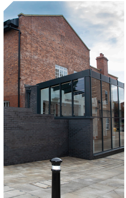
Creative Hub, Old Library, Wrexham

A lot of effort is put into making sure services are available throughout the site and installing new distribution throughout buildings. Please take the time to understand the hazards on site and respect the work of others. If you need information on where services are, if they're live, or to move them out of your way, please speak with the Site Manager.