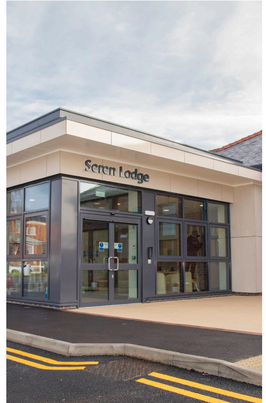
Seren Lodge

Since the introduction of new Procurement Acts in 2023/24, local authorities and health boards are increasingly asking for carbon reduction plans when appointing contractors. If part of your business includes working directly for these clients, are you prepared for what they need?