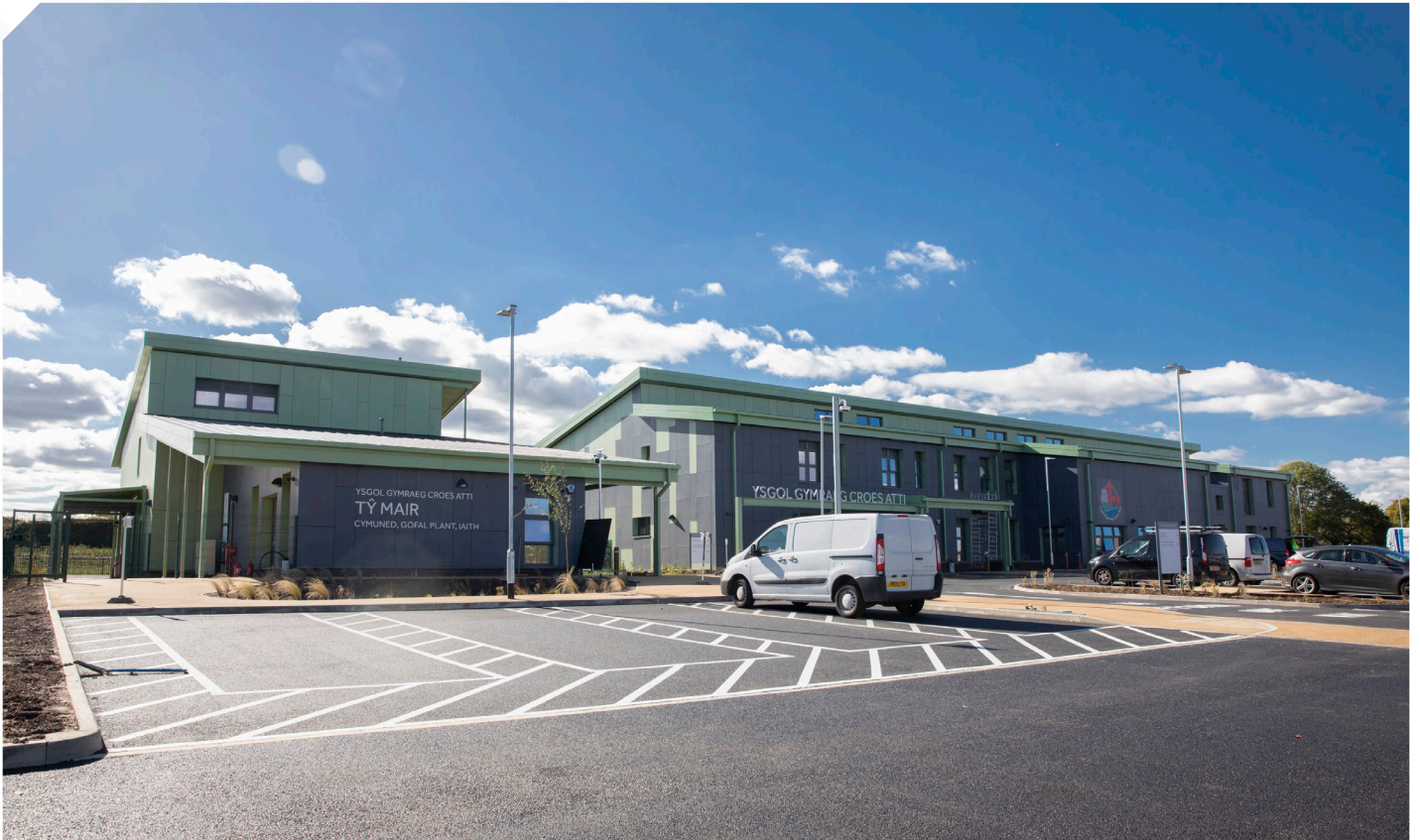
Ysgol Croes Atti, new primary school, Flint

If you haven't yet connected with your local CITB Customer Engagement Officer, now is the ideal time to ensure you're fully aware of what support is still available and how to access it efficiently.