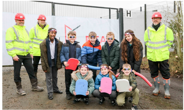
Start of Works Celebration at Dawley Leisure Centre, Telford